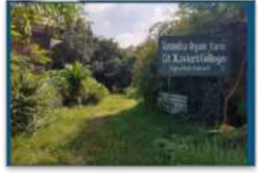
South Asia JPIC Meet