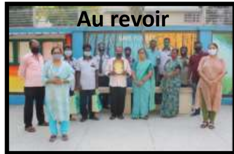
Chattru Bhaiya- the very incarnation of altruism and generosity.