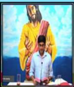
Retreat for the students of the Middle and Senior School