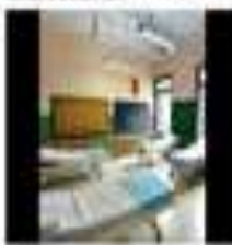
Patients in the ward at the hospital.

Catholic priests and nuns have joined the fight against COVID-19 in Kolkata. They are providing medical aid and support to patients in the hospital. The nuns are also providing food and other necessities to the patients.