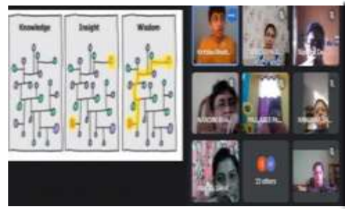
Incorporating critical thinking