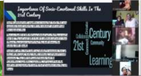
Socio-Emotional Workshop by Ivy Banerjee