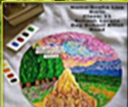
Xavo Christi-CLC Programme