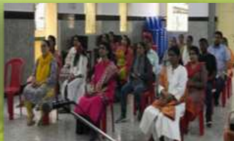
'Spiritual Enrichment' Retreat for Christian Teachers