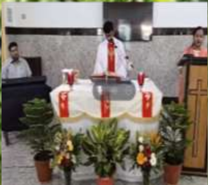
First Friday Mass