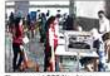
The camp at DPS Newtown