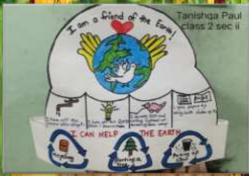
Earth Day Celebration