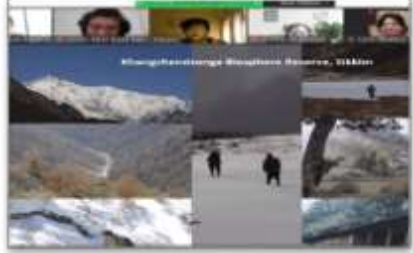
Girls Up Orientation