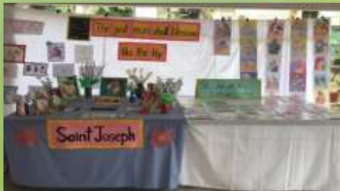
St. Joseph-A Model of Fortitude and Faith