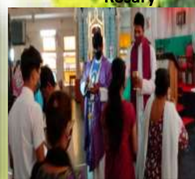
All Souls' Day Mass