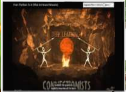
Super Teacher Workshop & Van Mahotsav