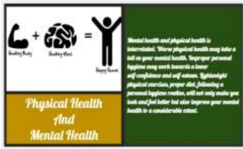
Mental Health Webinar by Ivy Banerjee