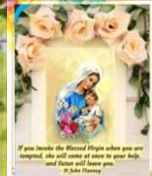
Recitation of the Holy Rosary