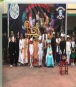
Nativity Play and Mass