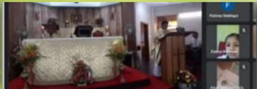
Thanksgiving Mass and Anglo-Indian Day Programme

"For where two or three gather in my name, there am I with them"-Matthew 18:20