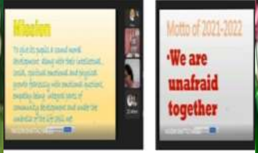
Student Council Orientation